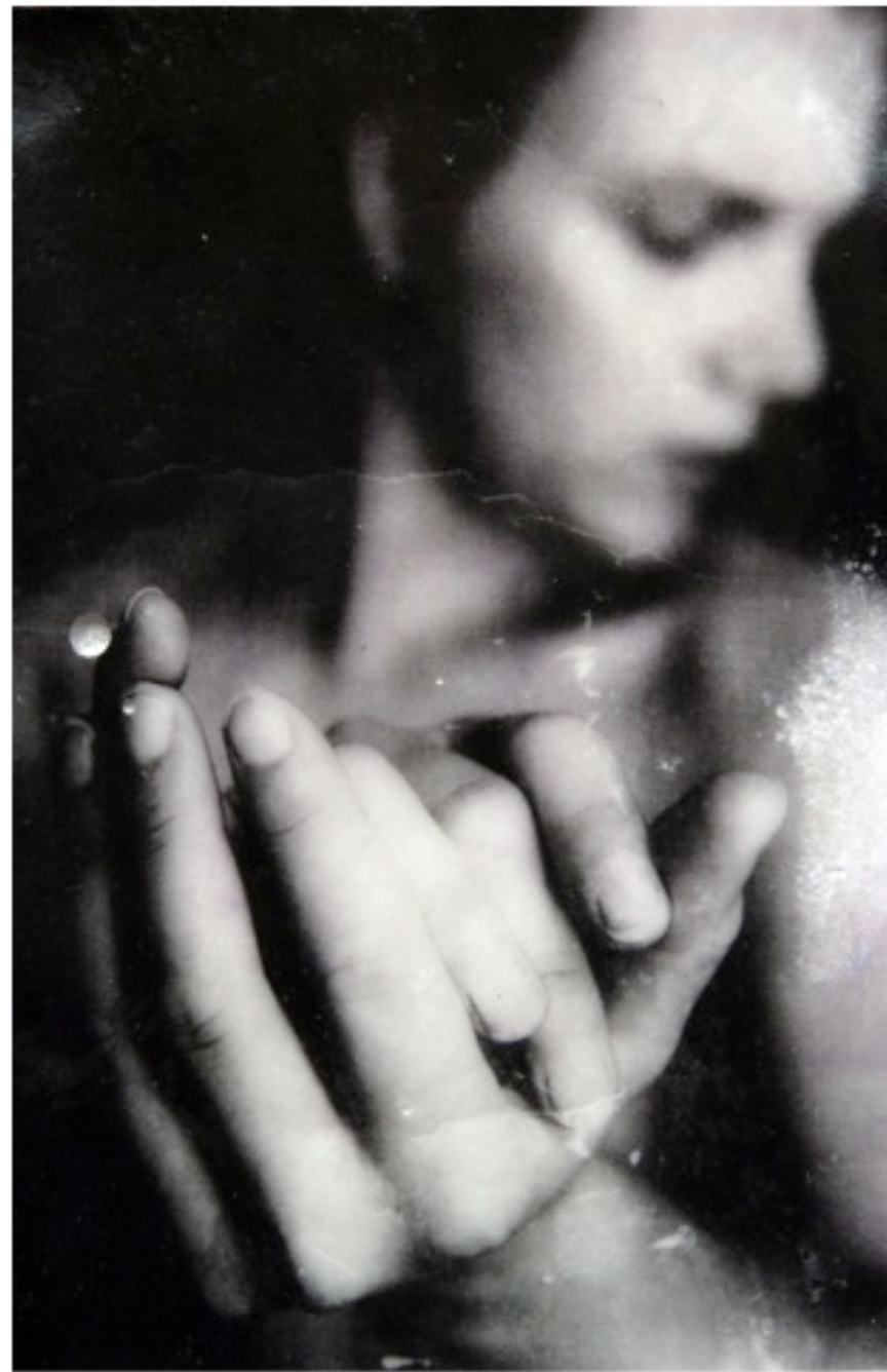
Senza Titolo - 2008 Photographic prints on wax, 27,5x18.5 cm.