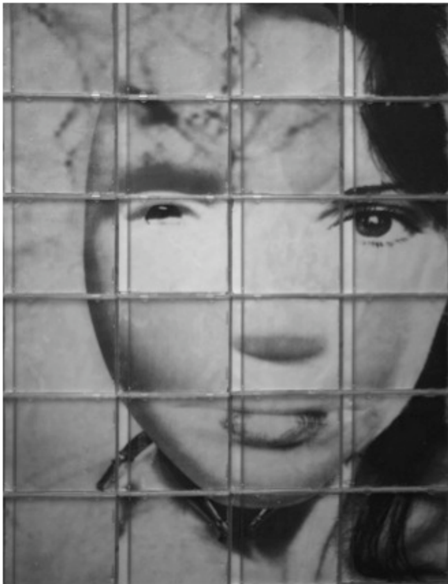
Parry.Colby - 2009

Photographic prints on wax , Scottex support, CD format, 75x54cm.