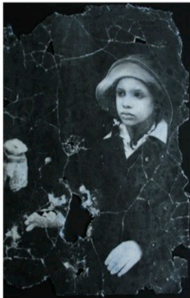
Photographic prints on wax , linen & wood support, 30x20 cm,