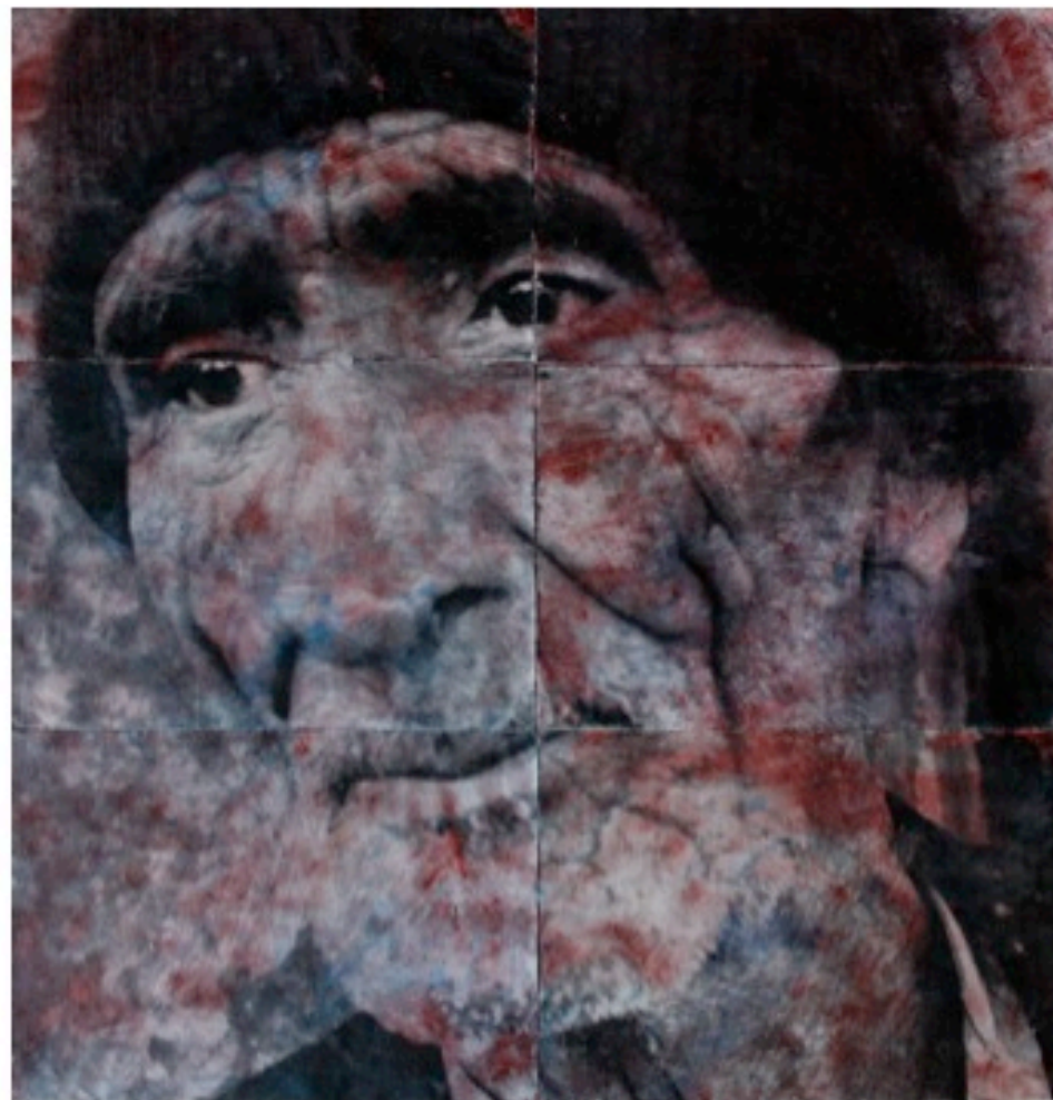
Photographic prints on wax, felt support with gel and caramel, 54x54 cm.