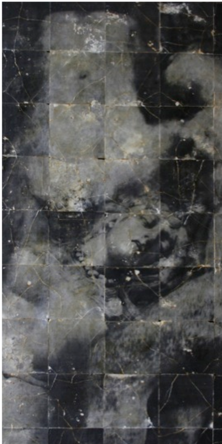
Sospeso – 2010

Photographic prints on wax whit caramel, 170x90 cm.