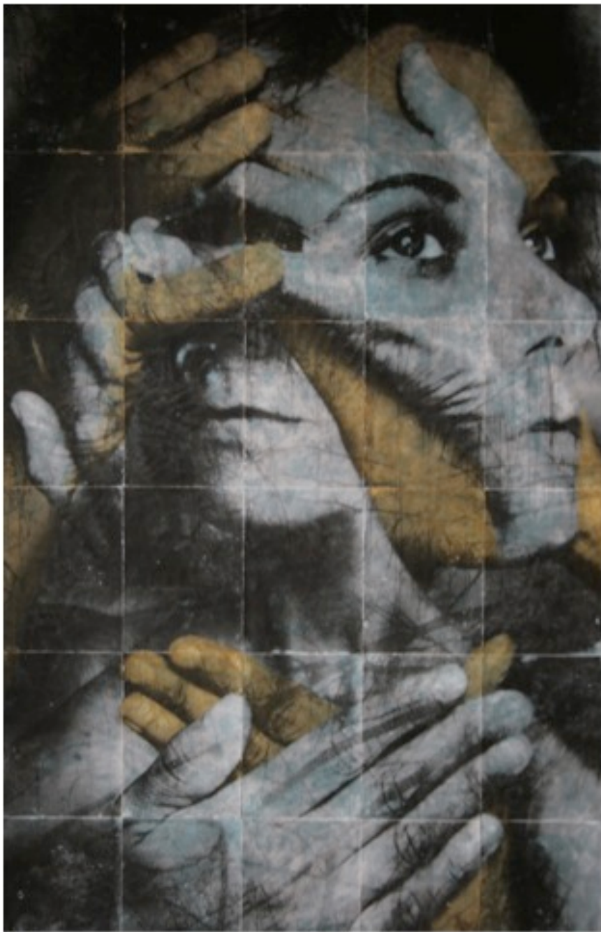
L'ironia della vita - 2010 Photographic prints on wax, felt support with pigment, 160x100 cm.