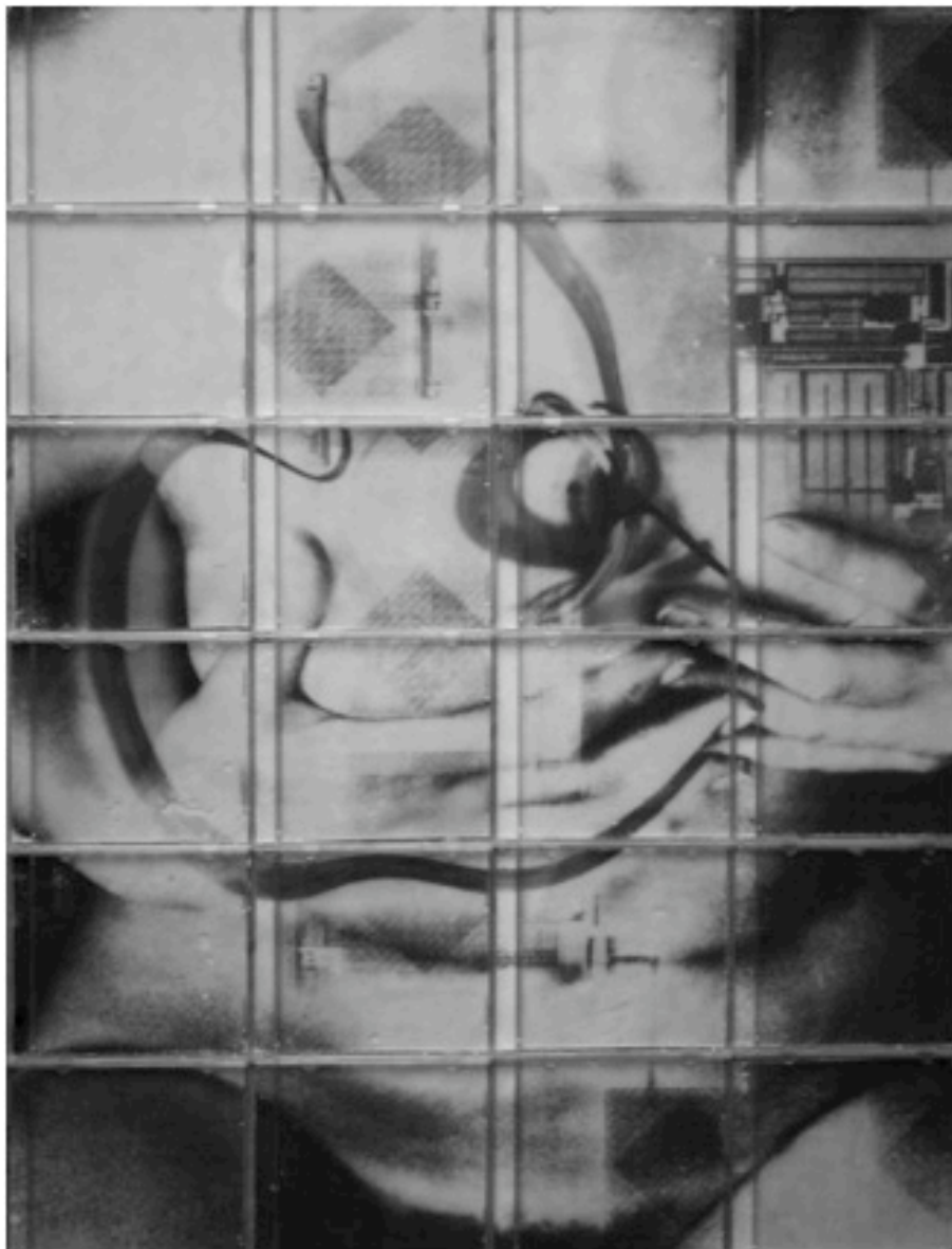
Shrdlu. Winograd – 2009

Photographic prints on wax , Scottex support, CD format, 75x54cm,