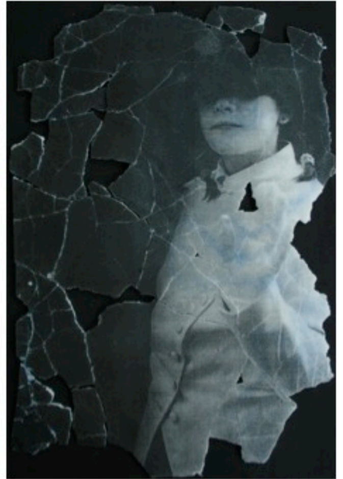
Photographic prints on wax , linen & wood support, 30x20 cm