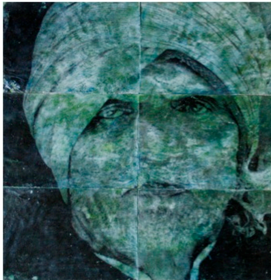
Photographic prints on wax, felt support with gel and caramel, 54x54 cm.