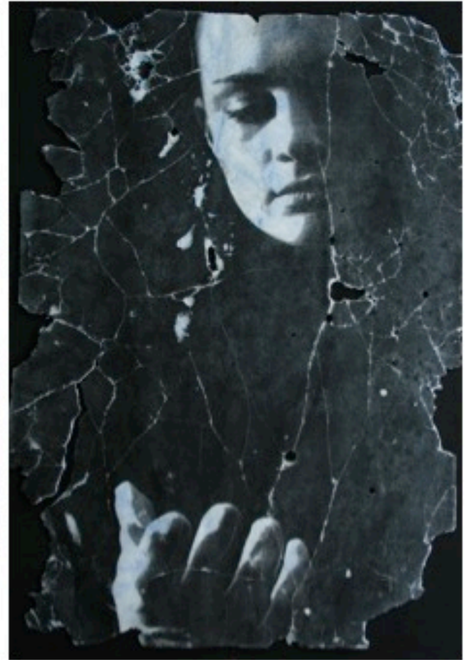
Photographic prints on wax , linen & wood support, 30x20 cm