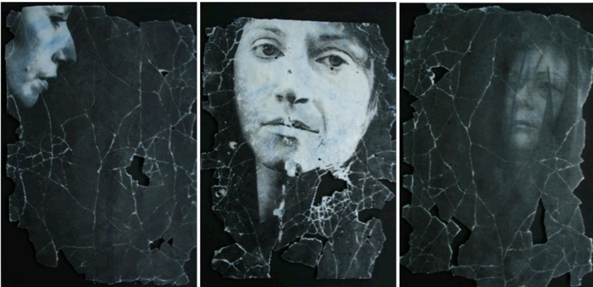
Photographic prints on wax , linen & wood support, 30x20 cm