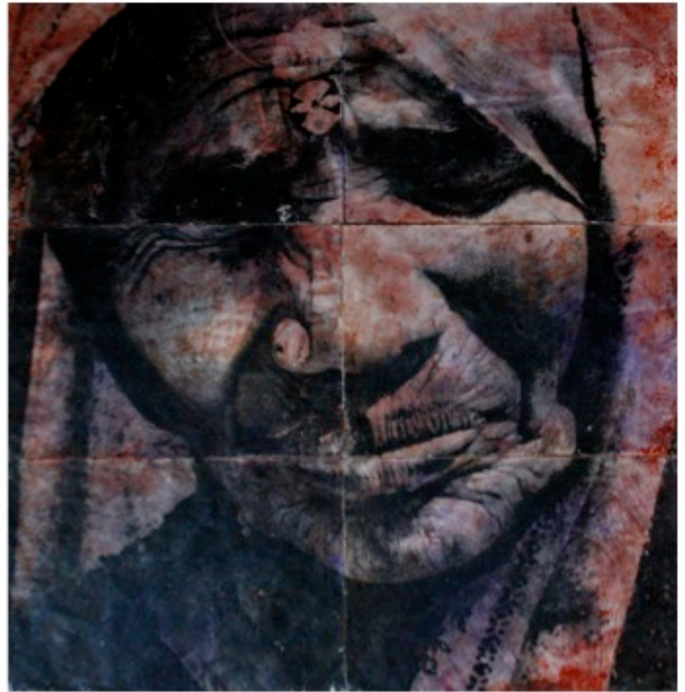
Photographic prints on wax, felt support with gel and caramel, 54x54 cm.