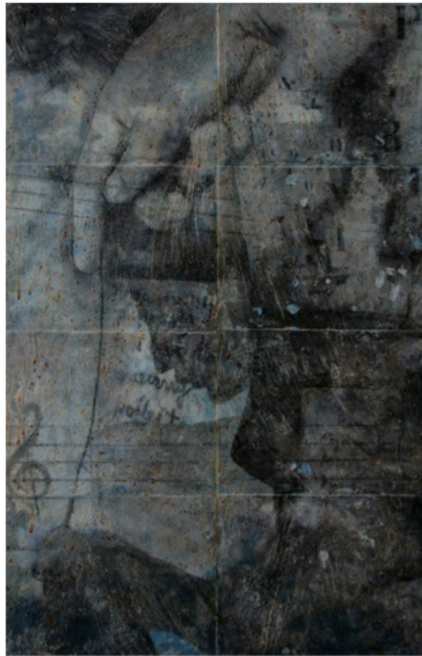
There's a time for the clouds -2010

Photographic prints on wax with pigment, 32,5x22.5 cm.